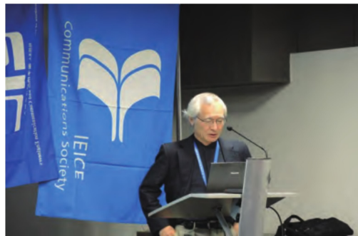
Fig. 2 Keynote speech by Professor Fumiyuki Adachi.

The next ICTF conference is organized on 28-30 of May 2014, in Poznan, Poland ( http://www.ictf2014.org ). In 2015, the conference will be located in Manchester, United Kingdom.