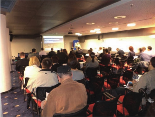
Fig. 3 Participants at STF 2012.