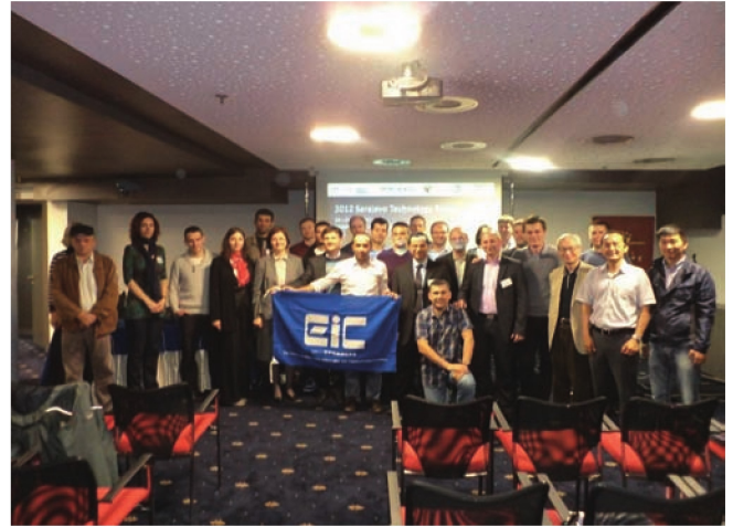
Fig. 4 Forum speakers.